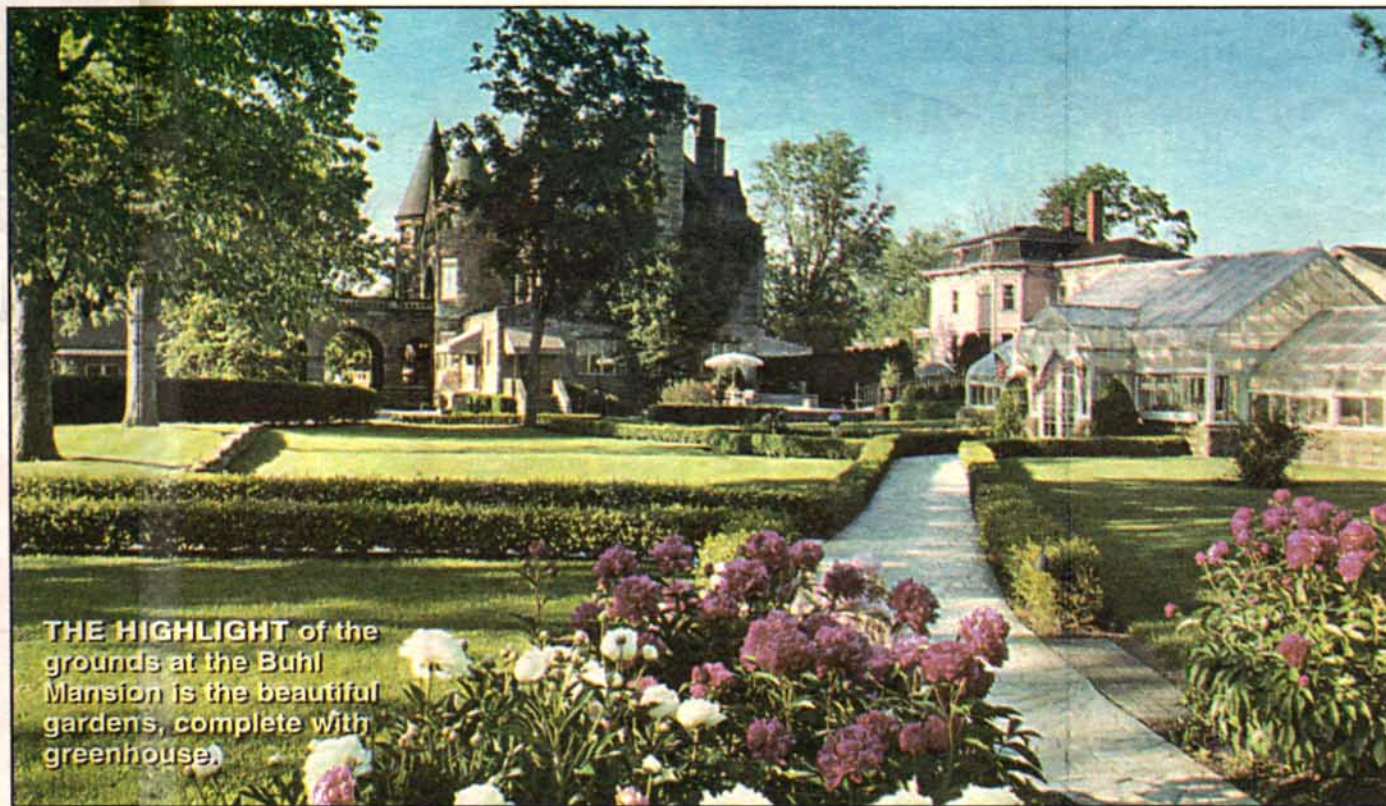
THE HIGHLIGHT of the grounds at the Buhl Mansion is the beautiful gardens, complete with greenhouse.