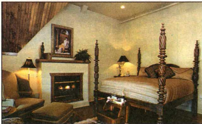
THE 28-FOOT high turret and Jacuzzi (at right) is the highlight of The Grand Turret (above), one of the Buhl's most popular rooms.