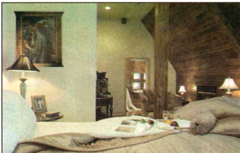
FOR NEWLYWEDS , nothing is preferred more than the regal Grand Gables room.