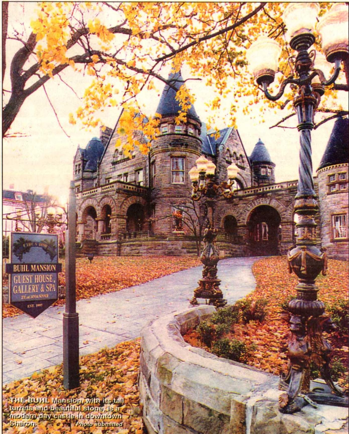
THE BUHL Mansion, with its tall turrets and beautiful stone, is a modern day castle in downtown Sharon. Photo submitted

Also popular is Grand Turret, where guests enjoying a Jacuzzi bath can look up to the 28-foot high cone-