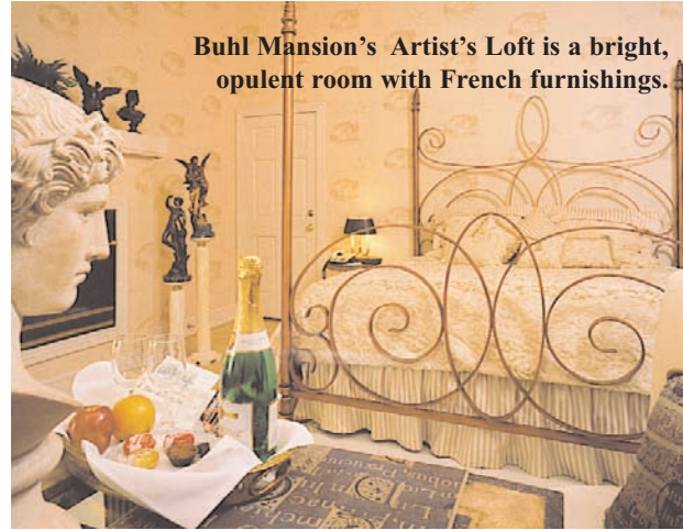
Buhl Mansion's Artist's Loft is a bright, opulent room with French furnishings.