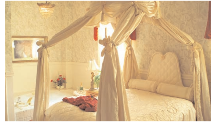
Above: Belles Boudoir, one of the theme rooms at Tara. Below: You can arrive by limosine to Ashley's fine dining restaurant famous for their seven course dinner,

As a guest at either inn, you can walk through the hallways and look at all the other lavish guestrooms. If a room is not occupied the door is left open, with a rope across the entrance, so guests can see some of the other elegant rooms.