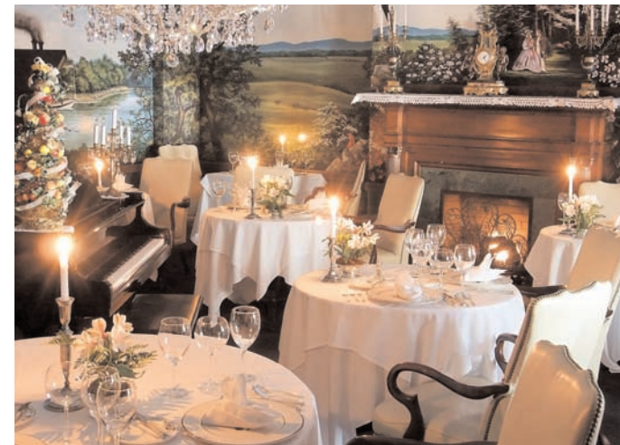
All 27 rooms at Tara are decorated with the Gone with the Wind and Civil War themes.