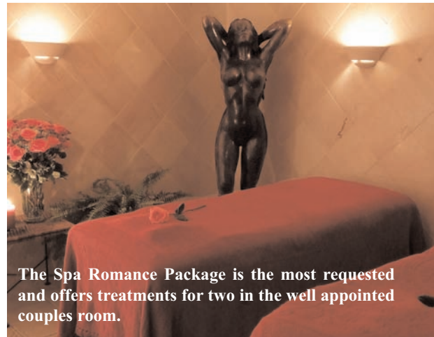
The Spa Romance Package is the most requested and offers treatments for two in the well appointed couples room.

treatments and an array of body treatments including Hydrotherapy. The Spa Romance Package is the most requested and offers treatments for two, including couples massages, facials, manicures, lunch and a bottle of champagne! It doesn't get any better!